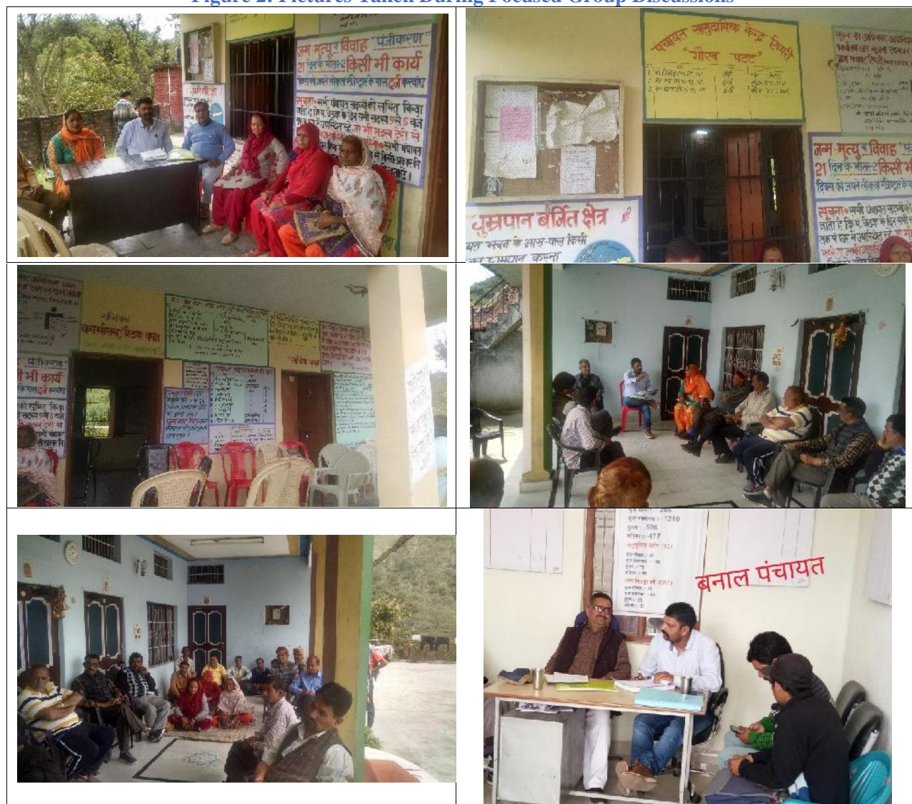
Figure 2: Pictures Taken During Focused Group Discussions