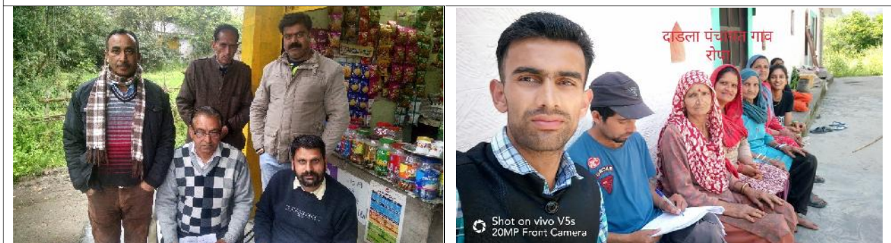
Figure 1: Pictures Taken During Primary Survey

A survey of primary stakeholders was carried out with the help of a pre structured questionnaire. The aspects covered in the questionnaire were identification particulars of PAFs, social profile, family details, occupation, source of income, family expenditure, household assets, information on affected structure, commercial/self-employment activities, employment pattern, opinion and views of PAFs on project and resettlement and rehabilitation. Most part of the questionnaire has been pre-coded except those reflecting the opinion and views of PAFs, which have been left open-ended.