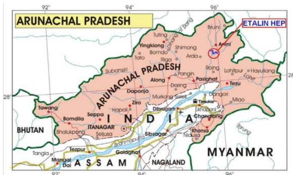
Fig – 1: Project Location

Location of the project is shown in figure-1 and project area accessibility is depicted in figure-2.